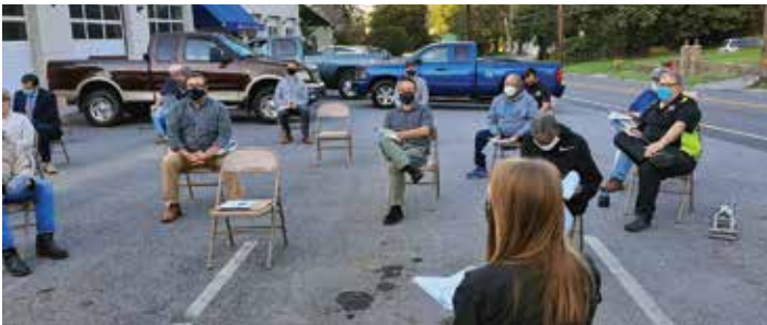
Numerous public meetings were held to solicit input for the plan.

http://eastfallowfield.org/2015pdf/Newlinville_Village_Master_Plan_adopied.4.27.21.pdf