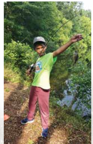
Scouts enjoying a day at Summer Camp.