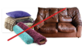
NO Clothing, Furniture & Carpet NO ropa, muebles y alfombras

To Learn More Visit: Para más información, visite: wm.com/recycleright