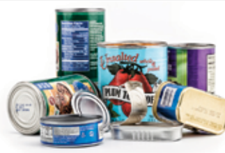
Food & Beverage Cans Latas de alimentos y bebidas