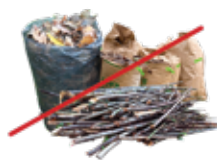
NO Green Waste NO desechos verdes