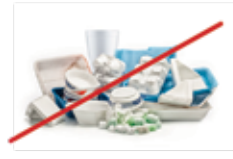
NO Foam Cups & Containers NO vasos y recipientes de poliestireno