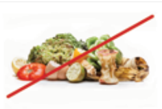
NO Food or Liquids NO comida o líquidos