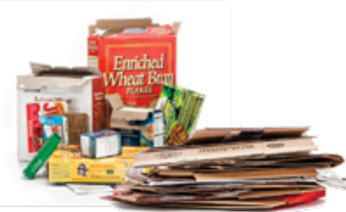
Flattened Cardboard & Paperboard Cartón y cartulina aplastados