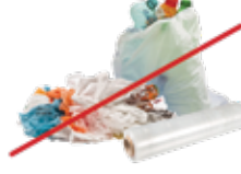
NO Loose Plastic Bags, Bagged Recyclables or Film Empty recyclables directly into your cart NO bolsas y envolturas de plástico sueltas, o materiales reciclables embolsados Vací directamente los materiales reciclables en nuestro carrito