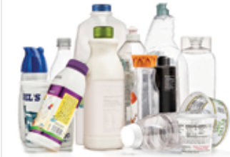
Plastic Bottles & Containers Botellas y envases de plástico