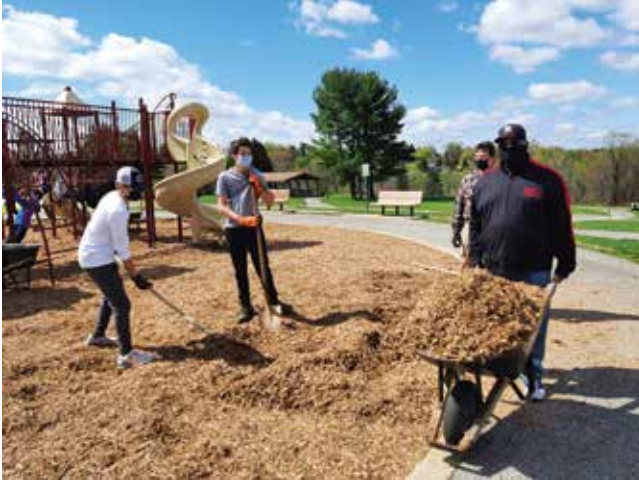
Volunteers helping out at Township's Spring Cleanup.