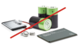
NO Batteries – check local drop-off programs for proper disposal NO baterías - Verifique los programas locales de entrega para su correcta eliminación