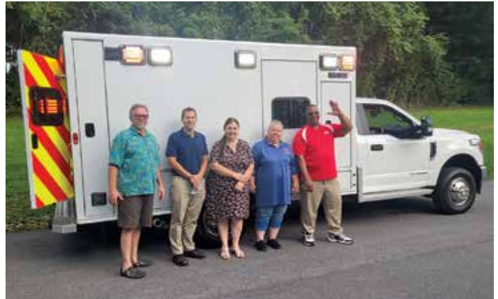
East Fallowfield Township's Board of Supervisors and Modena Fire Company representative inspecting the new ambulance that will soon go into service.

"The purchase of the new ambulance would not have been possible without the support of East Fallowfield Township. The Modena Fire Company would like to thank the Board of Supervisors and East Fallowfield Township residents for their continued support," concluded Dowlin.