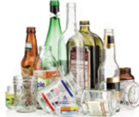
Glass Bottles & Containers Botellas y envases de vidrio