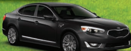
2016 KIA CADENZA