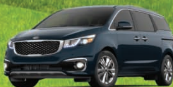
2016 KIA SEDONA