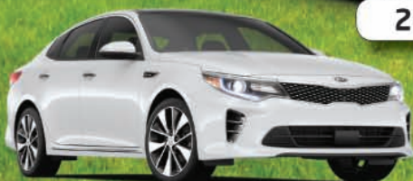
2016 KIA OPTIMA