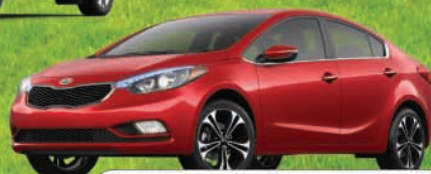
2016 KIA FORTE