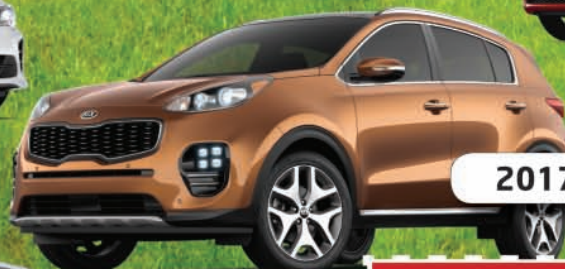
2017 KIA SPORTAGE