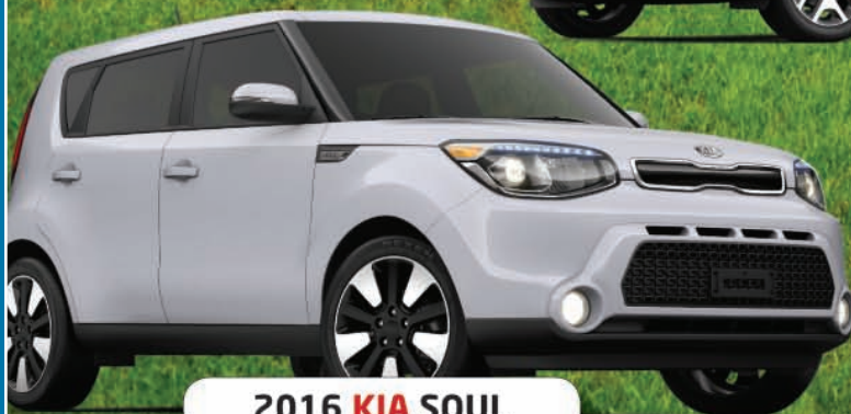
2016 KIA SOUL