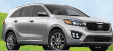
2016 KIA SORENTO